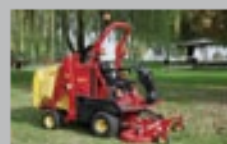
GT 23 hp