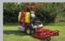
TURBOGRASS 22-23 hp