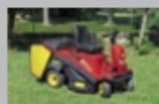
GTM - GSM 15.5-16 hp