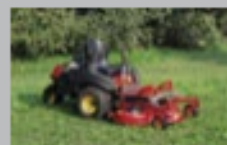
TURBO Z 23 hp