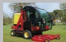
TURBO 1-1W-2-4 28-44 hp