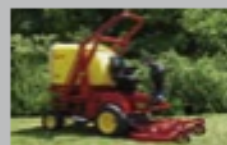
PG - SR 22-28 hp