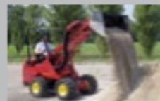
TURBOLOADER 22-36 hp