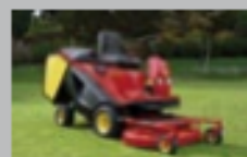
GTR 18-20 hp