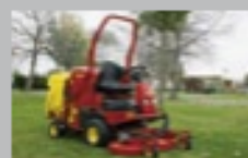
GTS 20-22 hp